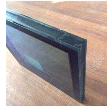
Image : Double Glazed/ Insulated